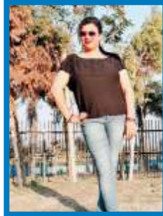
Kabita Das Medica Hospital Kolkata